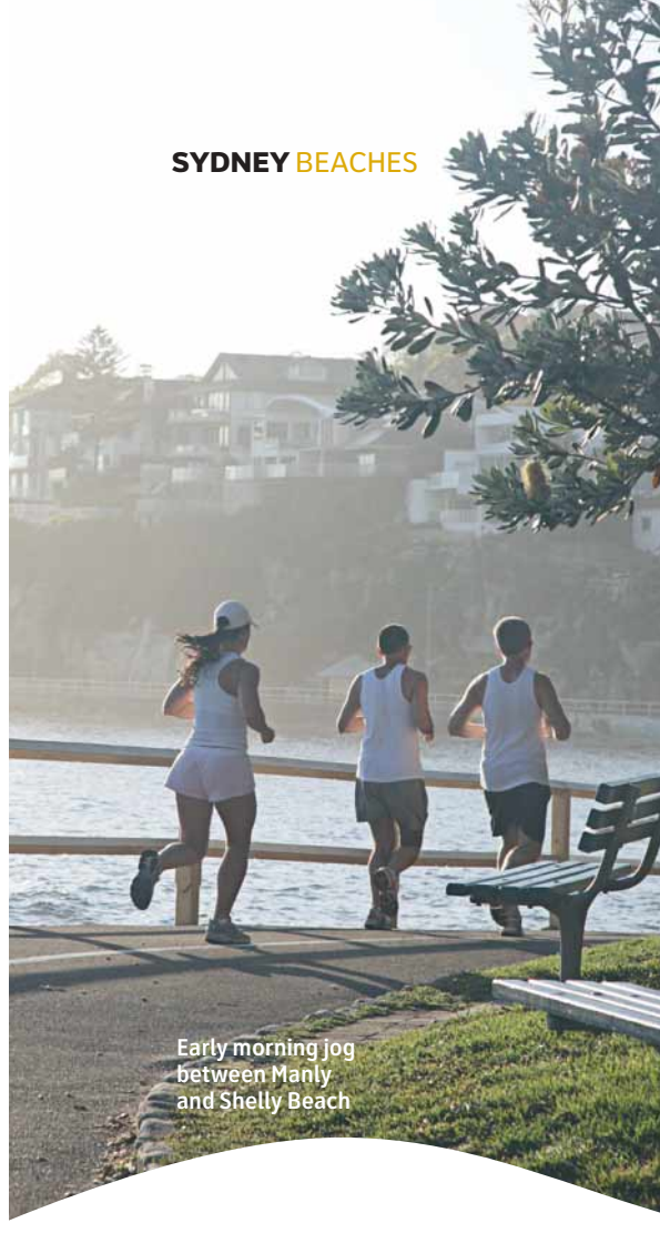
Early morning jog between Manly and Shelly Beach