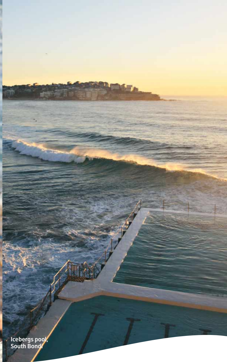
Icebergs pool, South Bondi