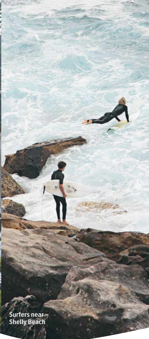
Surfers near Shelly Beach