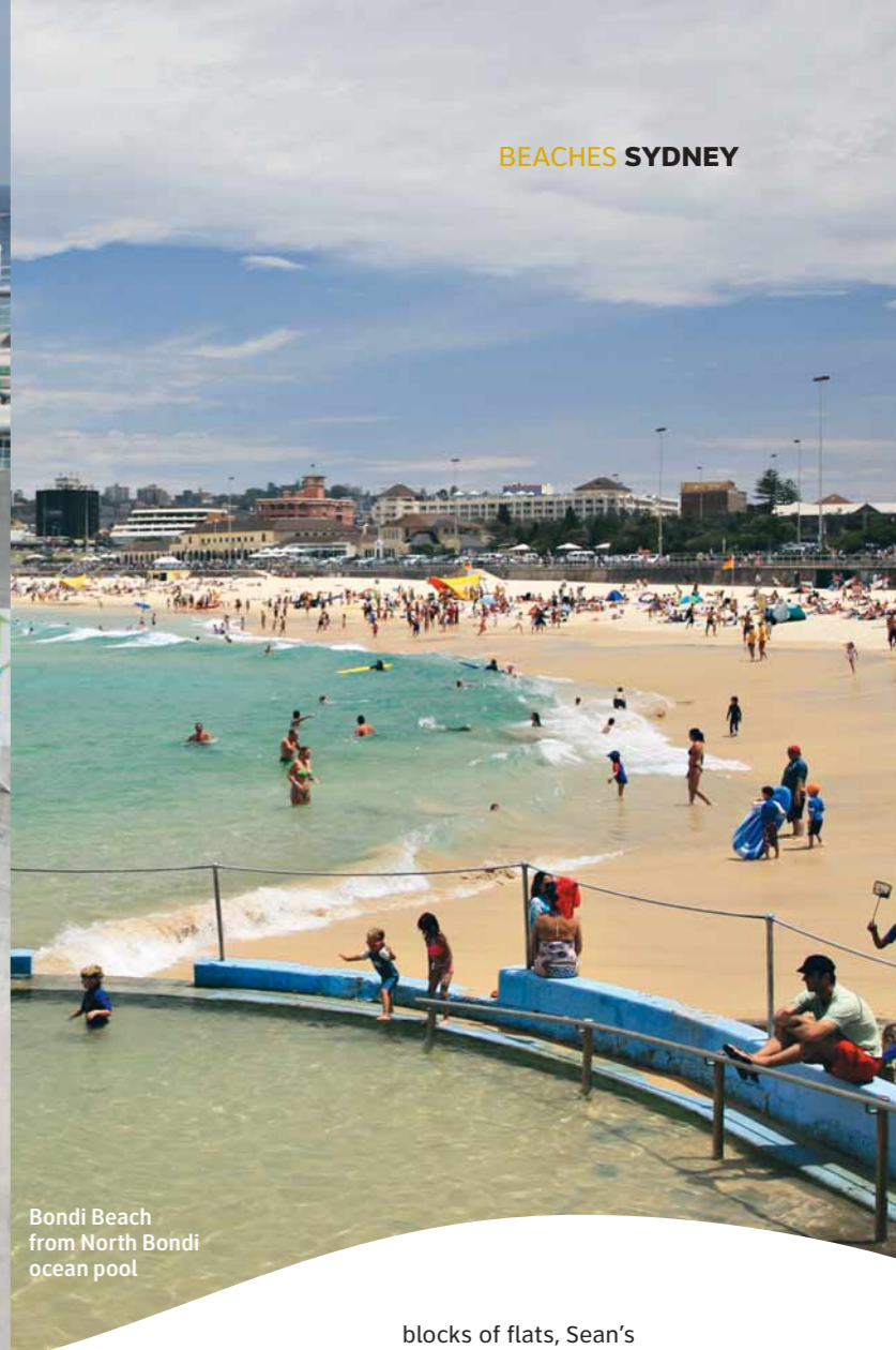
Bondi Beach from North Bondi ocean pool