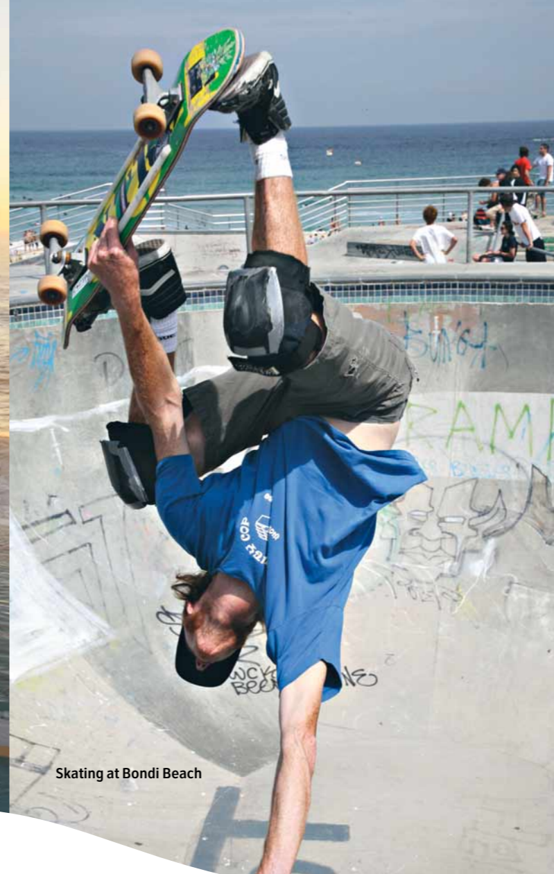
Skating at Bondi Beach